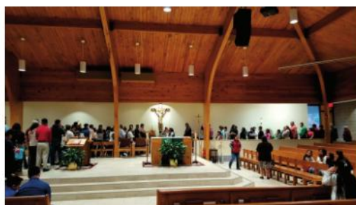
The community gathers after Mass, on February 10, around the newly installed crucifix.

G reat Gratitude goes to God for the blessings from our parish's congregation that supported the purchase and installation of our new crucifix on the wall behind the Altar in the Main Sanctuary. We are grateful to Bramante Studios (Kitchener, Ontario, Canada) for the artist who sculpted the bronze metal corpus of Christ hung upon the walnut wood cross. The symbols of the pincer (pliers) and hammer express Our Lady of La Salette's message. It invites all to collaborate in the ministry of Reconciliation by removing the sins (nails) of humanity upon the Body of Christ with a pincer (pliers). We can be super grateful to all our donors as the community responded so generously. All are welcome to go near the crucifix and offer your petition for a blessing or two or three. Amen.