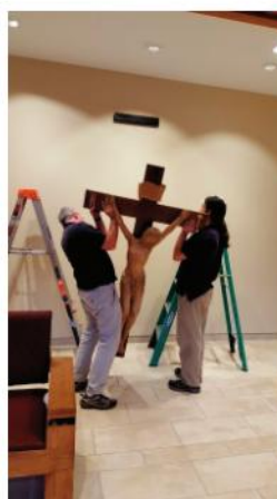
A special team install the new crucifix which is 6ft tall and weighs more than 80 pounds.