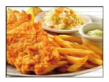
5:30 p.m. to 8:00 p.m.