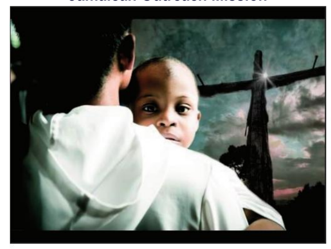
Missionaries of the Poor-Kingston, Jamaica

have known challenges in my life but certainly not hardships. I have heard. read, and seen on TV situations similar to the poor of Kingston, but not close up. Even now I still see in my mind the frugal rice bowls for meals. I also still see the beautiful faces of the residents. I can feel their love and remember experiencing their joy. I worked hard, but according to the veteran volunteers the shelters have come a long way since the early days. Blessings are everywhere - we have only to look! I wanted to make the trip to Jamaica for several years. Everything came together and once I got there I began to wonder if this was such a good idea. God is amazing!