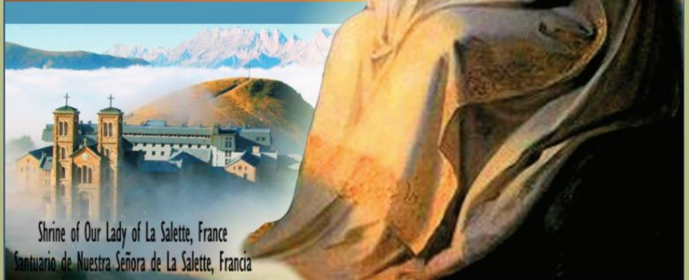
Shrine of Our Lady of La Salette, France Santuario de Nuestra Señora de La Salette, Francia

See Page 2 for Mass schedule. Ver Página 2 para horario de Misas.