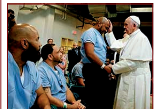
Pope Francis blesses an inmate at the Curran-Fromhold Correctional Facility in Philadelphia in September, 2015.