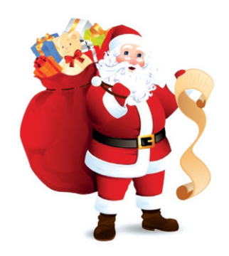
Hi Boys & Girls!

I will be in the Social Hall on Saturday, December 5th from 9:30 a.m. to 11:30 a.m.