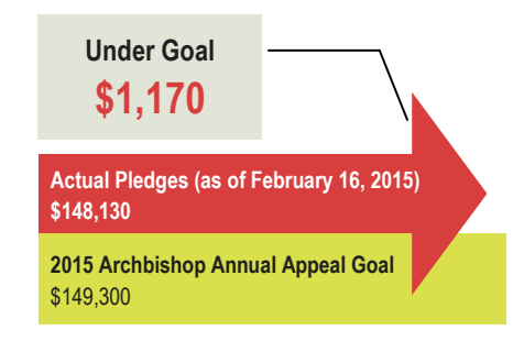
2015 Archbishop Annual Appeal Update

All pledges will be billed in ten monthly installments. Thank you in advance for your support!