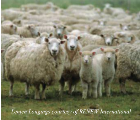
Lenten Longings courtesy of RENEW International

Give God thanks for desires stirred, insights gleaned, directions clarified, decisions reached, and for the gift of one another's openness and sensitivity. Pray the Our Father and conclude with the prayer on today's bulletin cover.