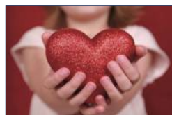
Children's Envelopes available in the Commons Area.

Time & Talent (Tiempo y Talento): ♥ I help my sister (Ayudé a mi hermanita) ♥ Helped with groceries (Ayudé con las compras) ♥ Cleaned my house (Limpié mi casa) ♥ Did what my parents said (Hice caso a mis papás) ♥ Give money to the church (Doné dinero a la iglesia) ♥ Helped people (Ayudé a la gente) ♥ I put clothes on the bed (Poner ropa en la cama) ♥ I gave $2 for those who are poor, and for all the people that needs help and those who are in the hospital (Doné $2 para los pobres, las personas que necesitan ayuda y aquellos que están en el hospital) ♥ I take my naps (Tomo mis siestas) ♥ I dressed my self and shared with brother (Me cambié yo solito y ayudé a mi hermano) ♥ Doing my make up work from school (Hice mi tarea de la escuela) ♥ I love Jesus and I know you love me so much (te amo Jesús y sé que me amas mucho) ♥ Made my bed, cleaned my room, brushed my teeth, got myself dressed (tendí mi cama, limpié mi cuarto, cepillé mis dientes y me cambié) ♥ I made a sacrifice in not watching TV (Hice un sacrificio y no vi TV) ♥ I prayed for the priests (Orar por los sacerdotes) ♥