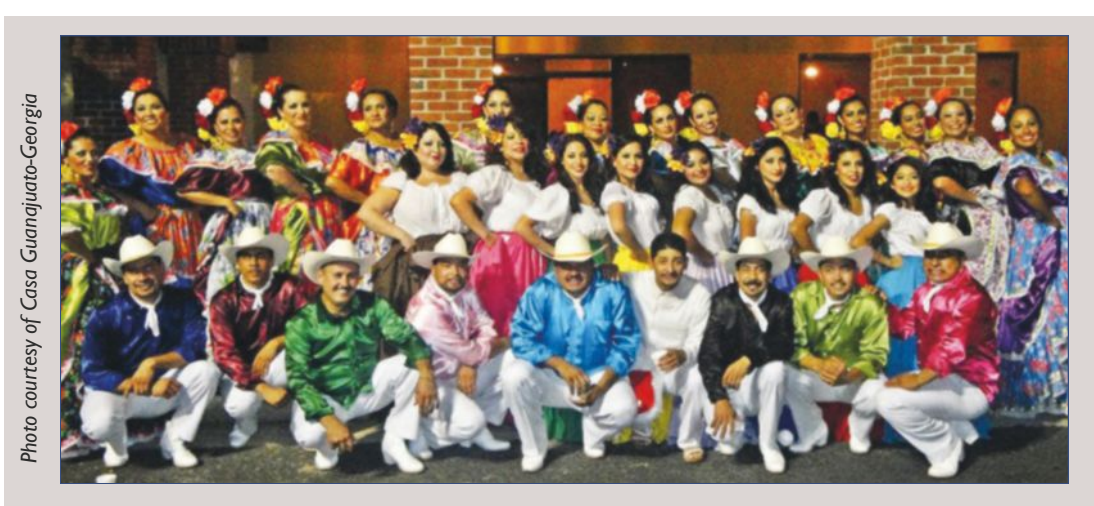
St. Thomas the Apostle Floklore Dance Group will present traditional dances from different states of Mexico on June 21 and June 22 at the Mable House Barnes Amphitheater.