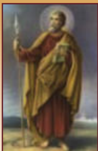
Saint Thomas the Apostle Feast Day Tuesday, July 3rd