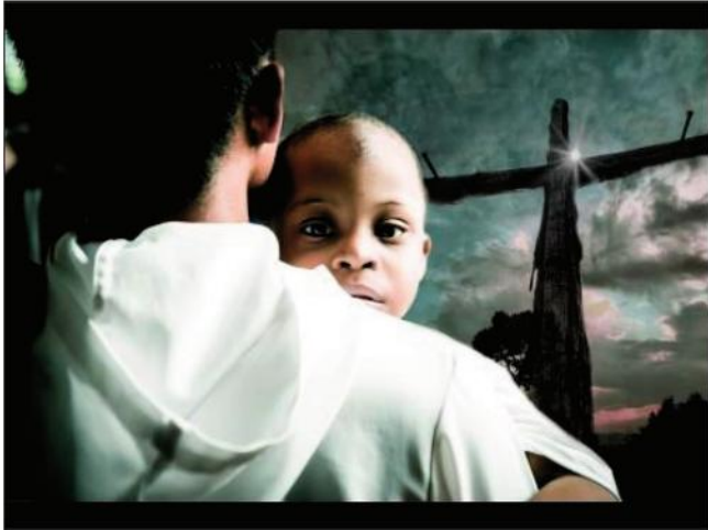
Missionaries of the Poor—Kingston, Jamaica

I have known challenges in my life but certainly not hardships. I have heard, read, and seen on TV situations similar to the poor of Kingston, but not close up. Even now I still see in my mind the frugal rice bowls for meals. I also still see the beautiful faces of the residents. I can feel their love and remember experiencing their joy. I worked hard, but according to the veteran volunteers the shelters have come a long way since the early days. Blessings are everywhere - we have only to look! I wanted to make the trip to Jamaica for several years. Everything came together and once I got there I began to wonder if this was such a good idea. God is amazing!