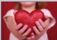
Children's Envelopes available in the Commons Area