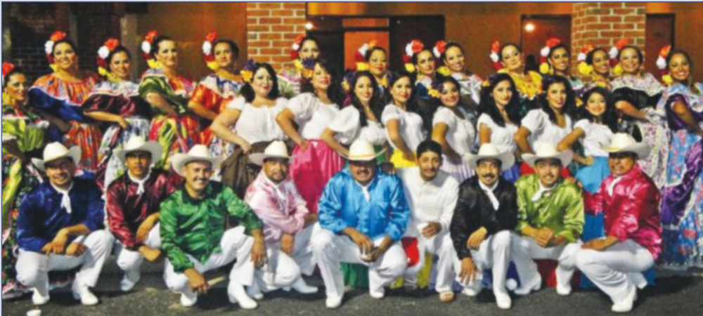
St. Thomas the Apostle Folklore Dance Group will present traditional dances from different states of Mexico on June 21 and June 22 at the MableHouse Barnes Amphitheater.