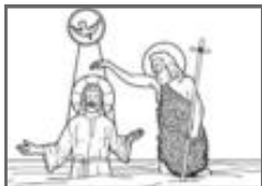
The Baptism of Repentance of the sinless Lamb of God by John, the cousin of Jesus.

Entrenamiento los días martes: 3, 10, 17 y 24 de julio 6:00 p.m. – 8:00 p.m. En la iglesia