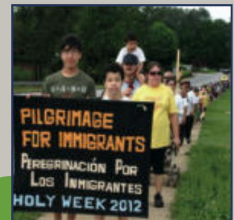
Holy Week 2012—Pilgrimage for Immigrants